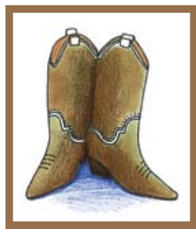
Boots from Lockhart Stamp Co.

When using colored pencil, lay your marker color down first, then color over it with your colored pencil. This will keep your tip from getting discolored. If you do put pencil down first, and you get it on your marker tip, quickly scribble onto scratch paper to get it off your tip. It won't ruin your tip, it will just look bad.