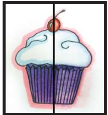
Versafine ink on Classic Crest Colors used: B32, R29, RV21, BV04, V04, 0 Cupcake from Lockhart Stamp Co.