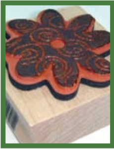
Flower from Inkadinkado

Since Copic Markers are alcohol based, you'll want to avoid coloring in images stamped with solvent inks like StazOn.