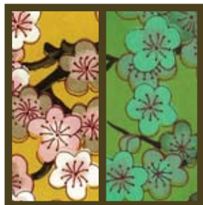
Before After Paper Source paper toned with a G02 marker

Test any new paper carefully. Very soft papers, like watercolor papers will give you rich color, but will be very hard to blend on since their fibers are so long. They will suck your marker dry faster and may bleed as well. Special Marker papers are coated and very thin, but color sits on the surface, making it tricky to stamp and blend on. Colored or patterned cardstock can be easily toned to the shade you want simply by coloring over it.